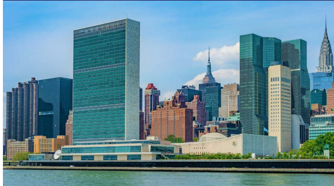
New York 24–28 March or 1–5 April 2024

Register and Wake Up in a City That Never Sleeps!