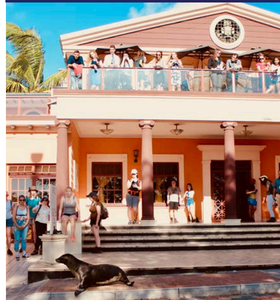
Galápagos Islands, Ecuador 22 Nov.–1 Dec. 2024