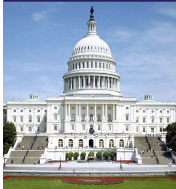
Washington, DC 8–10 November 2024