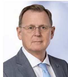
Bodo Ramelow Minister-President of the Free State of Thuringia